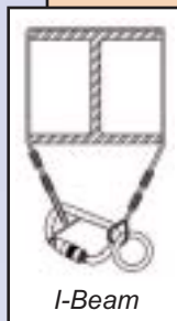
Cable Anchorage Connector Model #8187V