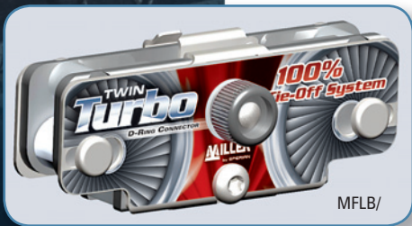
Twin Turbo D-Ring Connector

An effective solution when working with low fall clearance