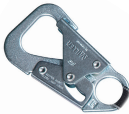
Miller 5K® Snap Hook 0.87 in (22 mm) Gate Opening