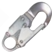
Aluminum Snap Hook 3/4 in. (19.1 mm) Gate Opening