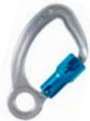
Aluminum Captive-eye Carabiner 0.86 in. (22 mm) Gate Opening