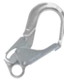
Aluminum Rebar Hook 2 1/2 in. (63.5 mm) Gate Opening