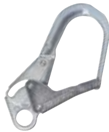
Steel Rebar Hook 2 1/2 in. (63.5 mm) Gate Opening